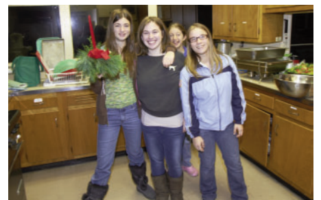
and spaghetti dinners were cooked!