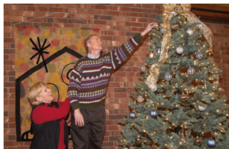
Christmas trees were decorated...