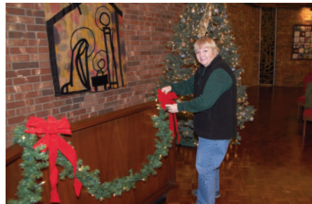
halls were decked...