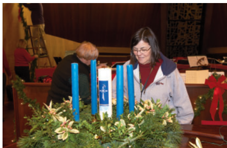
Advent wreaths were prepared...