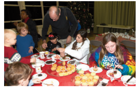
goodies were decorated...