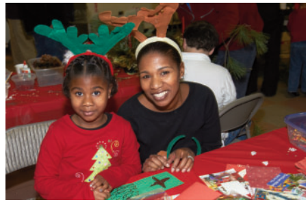
Christmas cards were crafted...