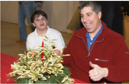
centerpiece masterpieces were created...