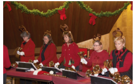
bells were rung...