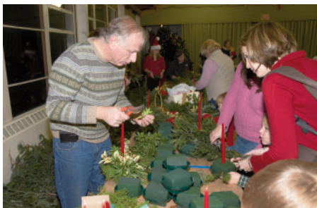
Greenery was snipped...